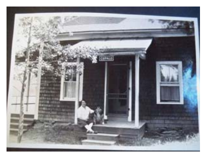
Historic photos of the Guest House (previously known as Cupalo Cottage). Ma Hurd is sitting on the porch in the photo on the right.