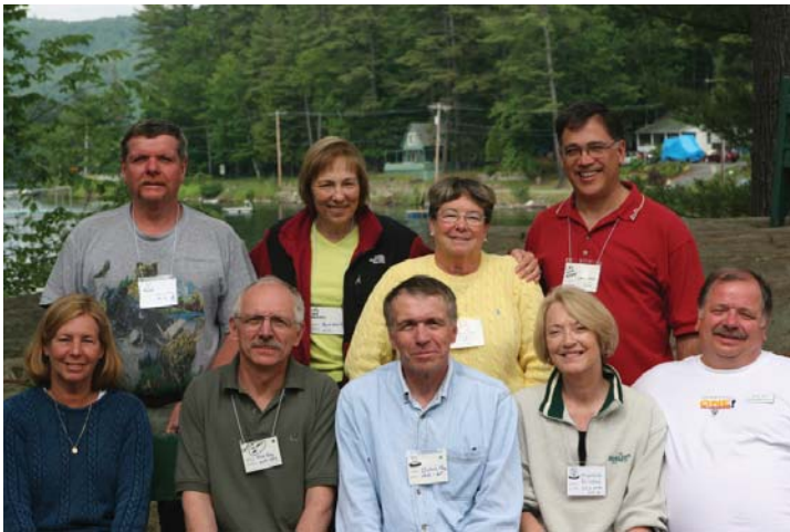
Extra points if you can figure out who in this photo is related!

The registration info is also on the Camp Billings website ( www.campbillings.org ) and can be downloaded for your use. All registrations must be mailed.