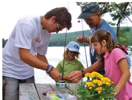
Fishin' out behind Dartt Hall.

The Lake House Inn, Route 244, Post Mills – 802-333-4025 Silver Maple Lodge & Cottages, Route 5, Fairlee – 802-333-4326 The Lake Morey Inn, Fairlee- 802-333-4311 The White Goose Inn, Route 10, Orford, NH – 603-353-4812 Dowd's Country Inn, Lyme, NH – 603-795-4712 Many others, including vacation home rentals in the area can be found on the internet.