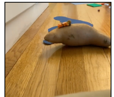
Potato Hill, anyone?